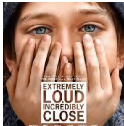
Extremely Loud and Incredibly Close June 7

Sponsored by Old Sloop Team of Welcoming Ministry of Hospitality