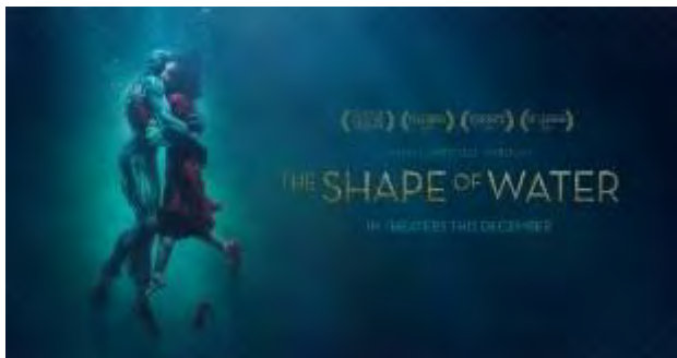
The Shape of Water May 31

May 24 - No film - Family Promise Week at First Congregational Church of Rockport